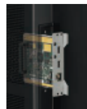
An optional board can slide into the slot on the back of the monitor.

The Intel Mini-OPS Expansion Slot supports the optional PN-ZB03W Wireless Board. It allows up to 10 devices—including Mac® or Windows computers, smartphones, and tablets—to connect to the PN-65SC1 simultaneously without any cable hassles. You can display the content of one device on the whole screen, or you can display the content from up to four devices on a 2x2 split screen. This wireless collaboration is a great way to enhance productivity in work or educational environments.