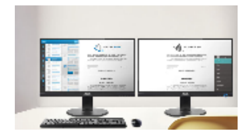
EasyRead mode for a paper-like reading experience