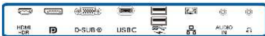
I/O back panel connector diagram