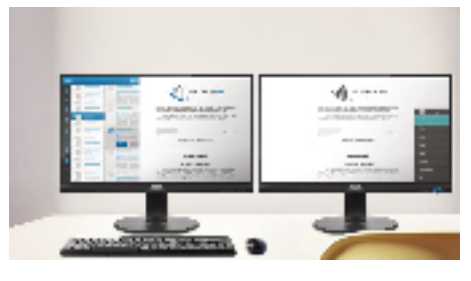
EasyRead mode for a paper-like reading experience