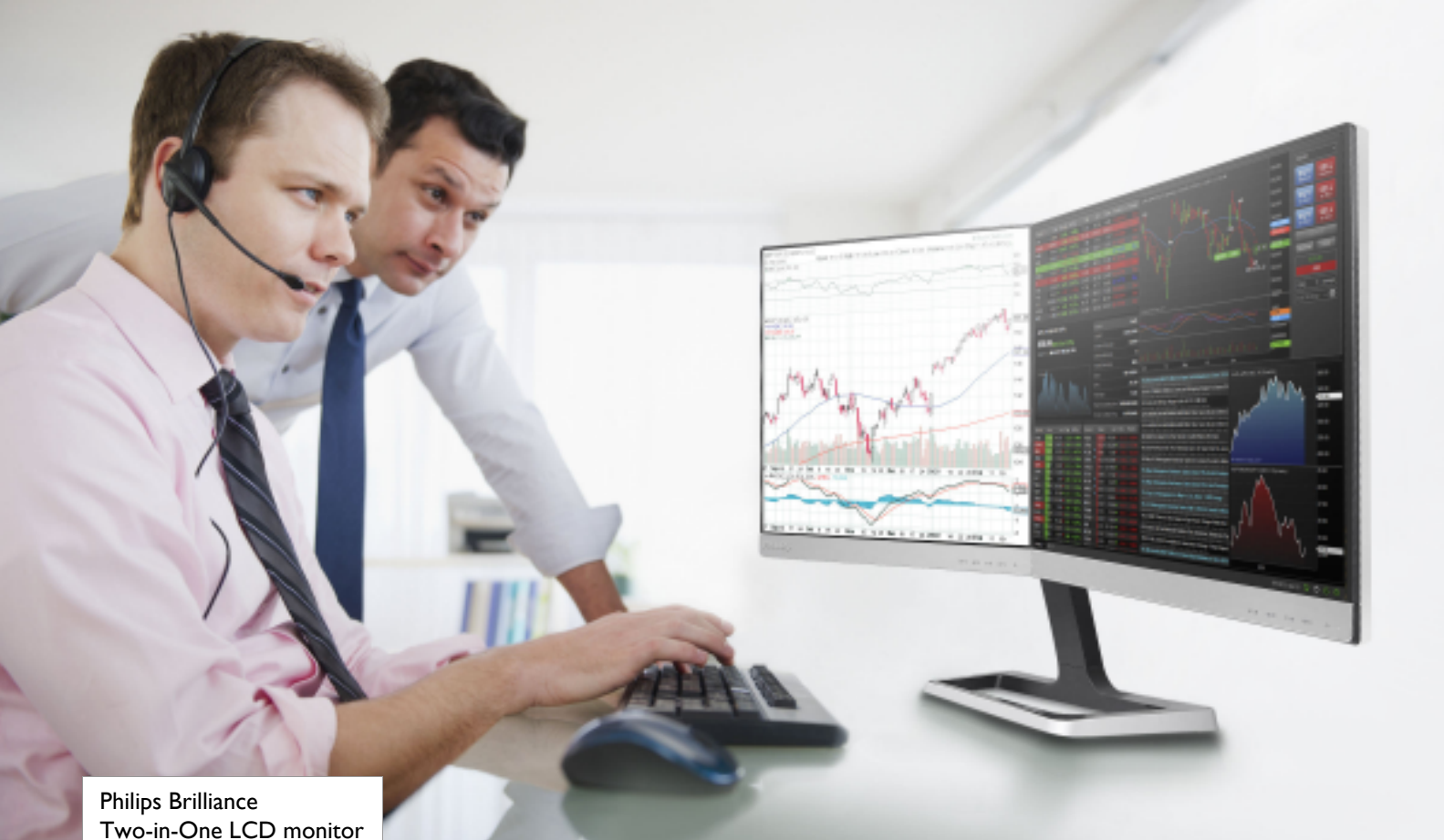
Philips Brilliance Two-in-One LCD monitor

P-line 19" x 2 / 48.0 cm x 2 Dual Monitor