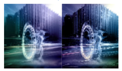
MPRT (motion picture response time) is more intuitive way to describe the response time,

which directly refers the duration from seeing blurry noise to clean and crisp images. Philips gaming monitor with 1 ms MPRT effectively eliminates smearing and motion blur, delivers shaper and precise visuals to enhance gaming experience. Best choice for playing thrilling and twitch-sensitive games.