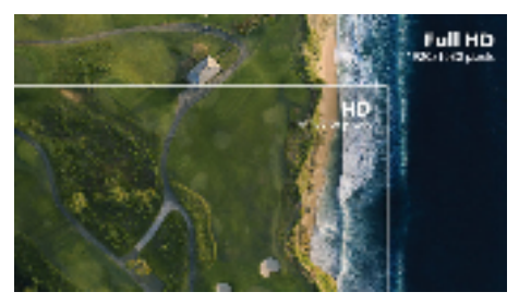
Picture quality matters. Regular displays deliver quality, but you expect more. This display features enhanced Full HD 1920 x 1080 resolution. With Full HD for crisp detail paired

with high brightness, incredible contrast and realistic colors expect a true to life picture.