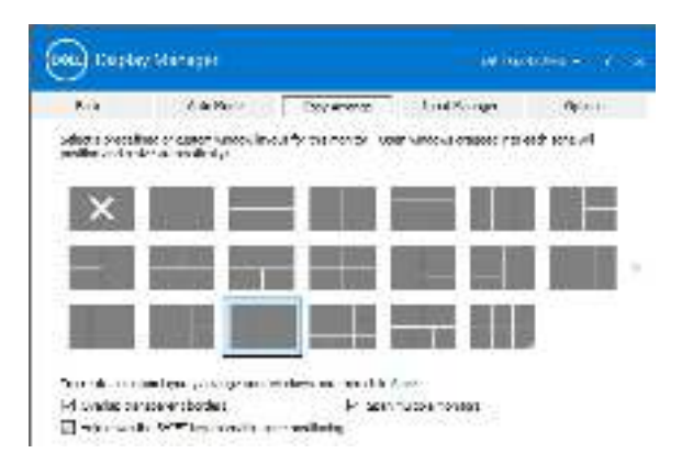
There are other advanced features of Easy Arrange :

If you are using multiple similar monitors in an array or matrix, Easy Arrange layout can be applied across to all the monitors as one desktop. Select Span multiple monitors to enable this feature. To make it effective, you need to ensure that the grouped monitors have the same resolution and are physical arranged properly.