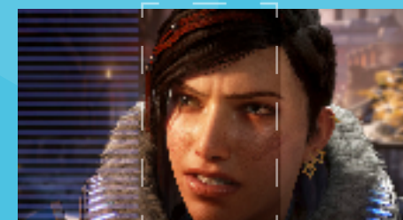
Flicker | Eye Care Technology | Blue Light Filter Off

The G25-20 comes equipped with AMD FreeSync™ Premium 2 technology that ensures a seamless gaming experience without screen tearing and stuttering. Handle any game with ease thanks to a 165 Hz refresh rate and 1ms response time with up to 0.8ms MPRT 1 that render smooth gameplay without motion blur or lag—perfect for those intense fight scenarios where lag can be the difference between winning and losing. High Dynamic Range (HDR) 2 decoding and 400nits brightness provide realistic colors with deeper contrasts, enhancing your gameplay.