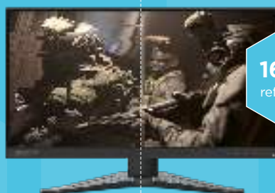
No AMD FreeSync™ Premium 2 Technology | AMD FreeSync™ Premium 2 Technology On

Everything about the G25-20 is geared towards enhancing speed and the user experience. The 24.5-inch screen ensures all on-screen movement is within view, while the NearEdgeless FHD display with 1920 x 1080 resolution provides a riveting experience without distractions. With Lenovo Artery software, 4 you can quickly and easily access special gaming functions, 5 as well as advanced gaming tools and functionality to give you a competitive edge.