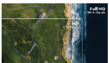
Picture quality matters. Regular displays deliver quality, but you expect more. This display features enhanced Full HD 1920 x 1080 resolution. With Full HD for crisp detail paired

with high brightness, incredible contrast and realistic colours, expect a true-to-life picture.