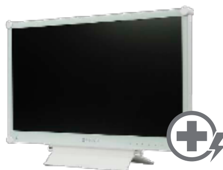
IEC/EN 60601-1 Medical-Grade Power Supply

The MX-Series adopts a specially designed low-voltage medical-grade power supply to ensure safety, performance, and reliability in any professional medical environment. Compliance with the IEC/EN60601-1 standards ensures their safe and reliable performance in demanding medical settings.