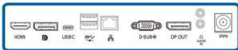
I/O back panel connector diagram