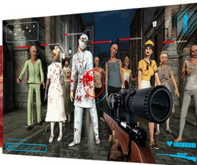
Low Input Lag ON