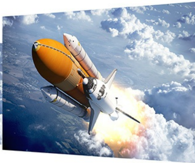
AMD FreeSync ON