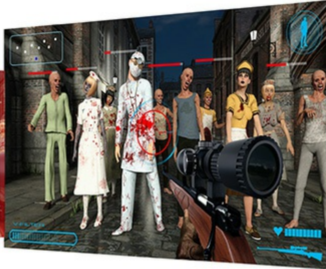
Low Input Lag ON