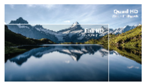
These Philips screens deliver Crystalclear, Quad HD 2560x1440 or 2560x1080 pixel

images. Utilizing high performance panels with high density pixel count, enabled by high bandwidth sources like USB-C, Displayport, HDMI, Dual link DVI, these new displays will make your images and graphics come alive. Whether you are demanding professional requiring extremely detailed information for CAD-CAM solutions, using 3D graphic applications or a financial wizard working on huge spreadsheets, Philips displays will give you Crystalclear images.