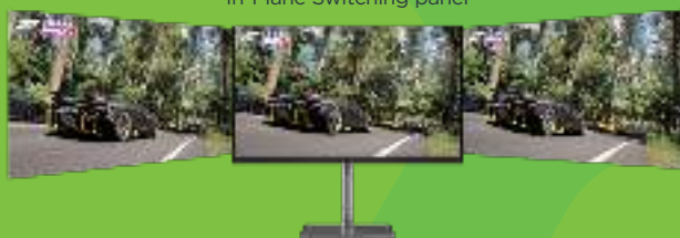
In-Plane Switching panel