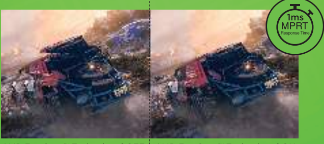
AMD FreeSync™ Technology<sup>2</sup> OFF AMD FreeSync™ Technology<sup>2</sup> ON

Whether you're gaming, streaming video, or studying - the Lenovo G24ge-20 Monitor gives an incredible performance to win at everything that you do. The sharp 23.8-inch 2560 x 1440 QHD resolution In-Plane Switching panel display delivers stunningly vivid visuals, making every little detail dramatically clear. It features a stunning In-Plane Switching (IPS) display Panel for spellbinding graphics performance. You can see true color from every angle without color distortion. You will particularly enjoy the 114% sRGB color space, and 90% DCI-P3 high color display that provides incredible true-color performance. The Natural Low Blue Light technology automatically reduces the blue light emitted from the panel without affecting the color performance - so that neither your eye health nor your viewing experience is compromised. The high 100 Hz (overclock to 110 Hz) refresh rate reduces stuttering and latency, while the 1ms MPRT<sup>1</sup> and 4ms extreme response time eliminate streaking and ghosting to provide an incredibly smooth gaming experience. The AMD FreeSync™2 VRR technology takes advantage of the hardware to boost the gaming experience even further by eliminating any chances of stutters and giving you a clear edge. With a crisp display and a rapid performance - the Lenovo G24qe-20 monitor gives you a spectacular 'clear' advantage in everything you do.