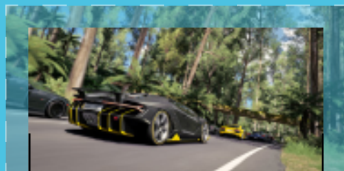
Good for E-Sports