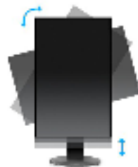
HAS + Pivot

The ProLite XB2283HS is an excellent 22" Full HD LED-backlit monitor with 1920 x 1080p resolution and VA panel technology guaranteeing accurate and consistent colour reproduction with wide viewing angles. Triple Input support ensures compatibility with the latest installed graphics cards and embedded Notebook outputs. The XB2283HS is also equipped with two high quality stereo speakers. The ergonomic stand offers 13 cm height adjustment with pivot and swivel, making this screen suitable for a wide range of applications and environments where workplace flexibility and ergonomics are key factors. The monitor is TCO and Energy Star Certified. A perfect solution for education, local government, business and finance markets.