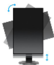
HAS + PIVOT

The ProLite B2483HS is an excellent 24" Full HD LED-backlit monitor with 1920 x 1080p resolution. It features 1ms response time and 12 000 000 : 1 Advanced Contrast Ratio, assuring clear and vibrant picture quality and high contrast. Triple Input support ensures compatibility with the latest installed graphics cards and embedded Notebook outputs. The ergonomic stand offers 13 cm height adjustment with pivot and swivel, making this screen suitable for a wide range of applications and environments where workplace flexibility and ergonomics are key factors. The monitor is TCO6 and Energy Star Certified. A perfect solution for education, local government, business and finance markets.