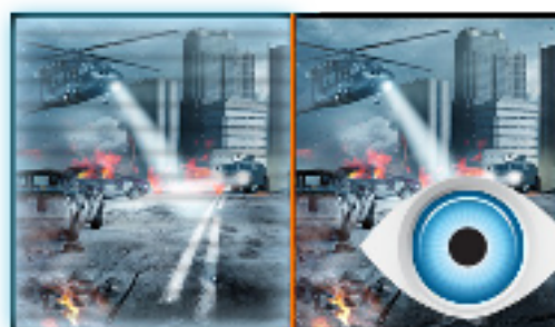
FLICKER FREE + BLUE LIGHT

With a height adjustable stand you will create an ergonomic work posture and position that meets all health and safety requirements. This will not only prevent any health issues but will also increase your productivity. The pivot function allows the screen to rotate from landscape to portrait orientation. This functionality can be useful if the application requires more height than width.