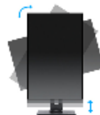
HAS + Pivot

A typical CCFL LCD uses four backlight lamps. Using LED diodes considerably lowers the power consumption and reduces the CO 2 emission into the environment making this LCD a true ECO-Friendly product.