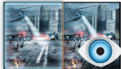
Flicker-free + Blue light

With true 1920 x 1080p resolution your monitor is ready to display high definition images. This means you can accommodate more information on your screen; e.g. 60% more in comparison to a 1280 x 1024 monitor.