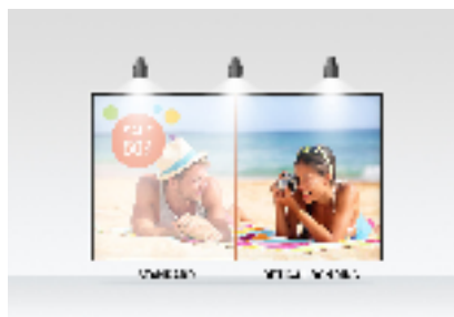
Optical bonded PCAP

The ProLite T2755MSC with its Full HD (1920x1080) resolution and with IPS panel technology offers exceptional colors and wide viewing angles. The Optical Bonded Projective Capacitive (PCAP) 10-point touch technology ensures a seamless and accurate touch response and a lower light reflection, in addition, the display is protected against humidity and potential moisture development. A special Nano coating ensures a smoother touch and less resistance in the swipe. It makes the screen less static and susceptible to dirt, dust and fingerprints. Its flexible stand can be positioned at several angles creating a comfortable and ergonomic user experience. A perfect choice for a vast array of applications.