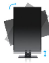
HAS (150mm) + PIVOT

A typical CCFL LCD uses four backlight lamps. Using LED diodes considerably lowers the power consumption and reduces the CO 2 emission into the environment making this LCD a true ECO-Friendly product.