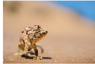
10 bit (LUT: 16 bit)

The LUT (look-up-table) on the CS2400R employs internal calculations with 16 bits for an extremely high colour depth and outputs the signals with up to 10 bits. This provides billions of hues for calculating the precise monitor display, effectively preventing display errors caused by the monitor such as banding or clipping, which can result in tonal breaks in gradients or unnecessary colours in greyscale. Even fine nuances and structures in dark or highly saturated areas of the image can be displayed in a differentiated and detailed manner.