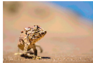
8 bit (LUT: 8 bit)