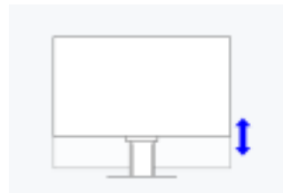
Height 155 mm

The CS2400R can also be rotated into the portrait format, which is a great advantage for tethered shoots of people in the portrait mode, for example.