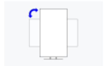
Rotation 90° (clockwise)