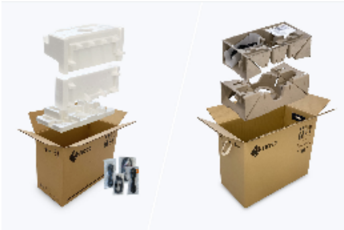
Left: conventional packaging / Right: environmentally friendly materials

For the packaging of the CS2400R, EIZO uses a padding made of moulded pulp cellulose. The material is made from recycled cardboard and paper and has a much lower environmental impact when disposed of than traditional polystyrene or plastic. All cables are stored in a cardboard compartment instead of being individually packed in plastic bags.