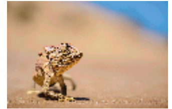
8 bit (LUT: 16 bit)