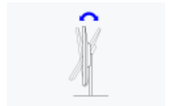
Tilt Between 5° forwards and 35° backwards