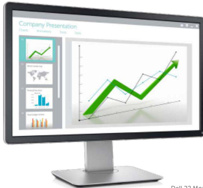
Dell 22 Monitor Model P2214H OEM Ready (21.5", 54.61 cm VIS)