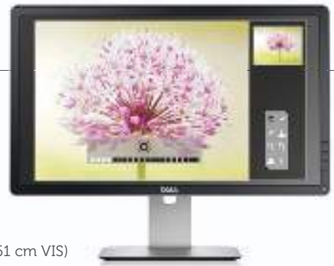
Dell 22 Monitor | P2214H (21.5", 54.61 cm VIS)