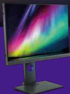
PhotoVue Photographer Monitor SW240