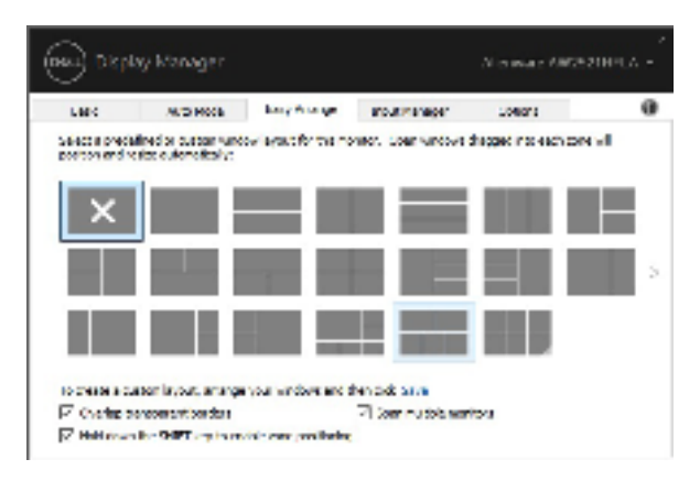
There are other advanced ways for the usage of Easy Arrange . Refer to table below.

If you are using multiple monitors in an array or matrix, Easy Arrange layout can be applied across to all the monitors as one desktop. Select " Span multiple monitors " to enable this feature. You need to align your monitors properly to make it effective.