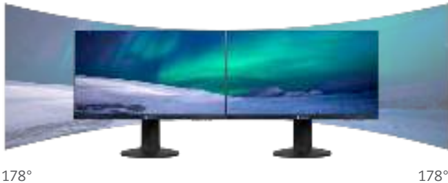
Wide Viewing Angle