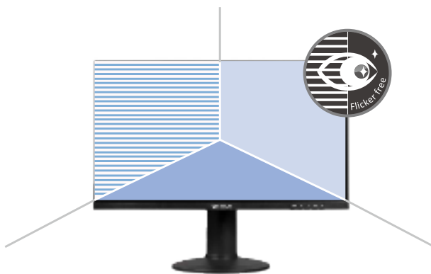
LOW BLUE LIGHT