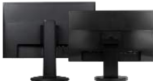
FS-27G / FS-24G