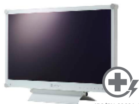
IEC/EN 60601-1 Medical-Grade Power Supply

The MX-Series adopts a specially designed low-voltage medical-grade power supply to ensure safety, performance, and reliability in any professional medical environment. Compliance with the IEC/EN60601-1 standards ensures their safe and reliable performance in demanding medical settings.