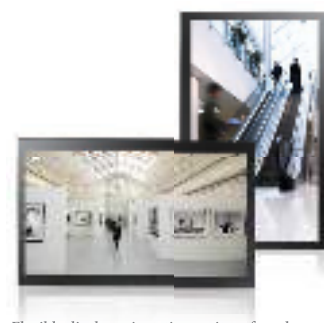
Flexible display orientations suit preferred content layouts