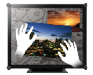
Integration of 10-point touch and projected capacitive touch technology provides accurate and precise touch experience