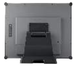
Durable metal housing and the whole enclosure designed with IPX1 level for drip-proof