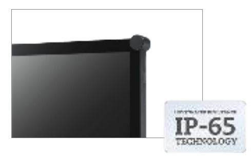
A rating of IP65 attests to its extraordinary protection against dust and liquid