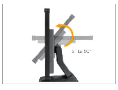
Wide range of tilt flexibility from -5^\circ to 90^\circ